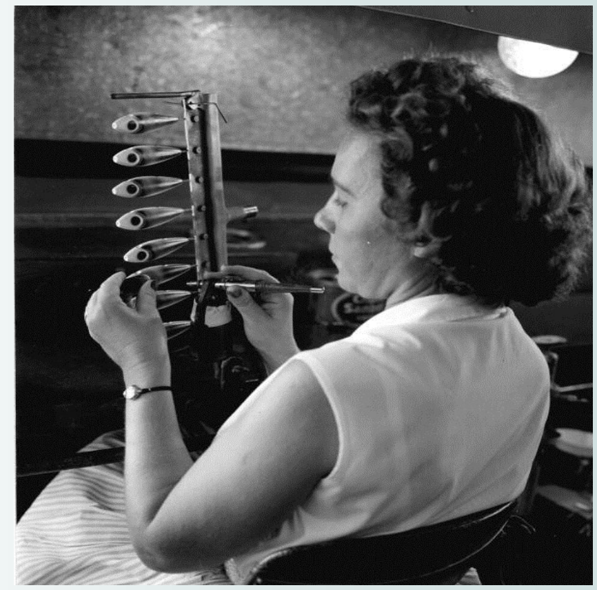
An employee airbrushing lures at a fishing tackle company—St. Petersburg, FL

November 18-20, 2011 CATC Fall Show Myrtle Beach, South Carolina