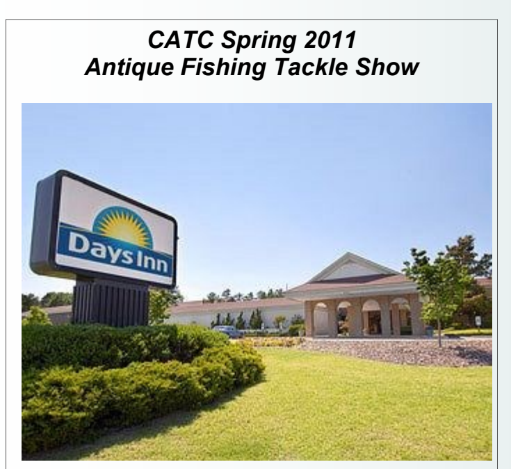
will be held at the Days Inn Conference Center in Southern Pines, NC on April 9-10, 2011. A show flyer and registration form is available on the CATC web site. Additional details are included in this newsletter.

The economy continues to be a damper on our Club and hobby. Therefore as we plan these shows we will continue to keep costs in mind and also the